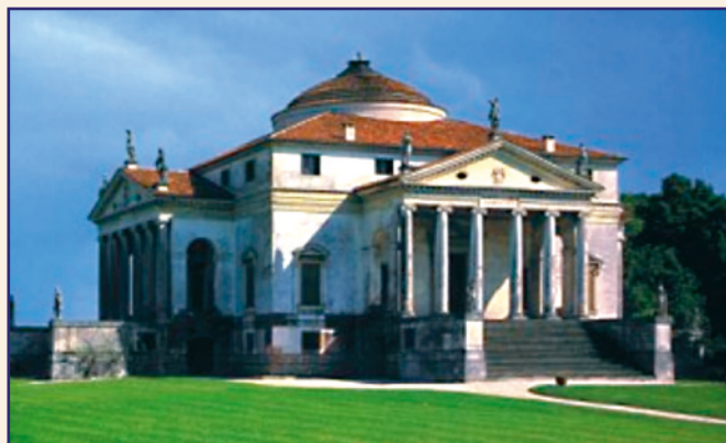
Already the villas of Andrea Palladio were planned according to the principles of Vasati. Also Vitruv, the pioneer of Roman architecture drew knowledge from the Indian Vastu scriptures. This underlines the significance of the Vastu principles as a n important root of European architecture.

diseases seems to be furthered, while a strong bioenergetic living field strengthens the power of resistance of its inhabitants. The old Indian geomancy Vastu has been shaped into a scientific system after millennia of experience and observation. With this you can find out the effects of environmental influences on man. It is founded in the sacred measure system of